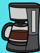
Drip Coffee Maker